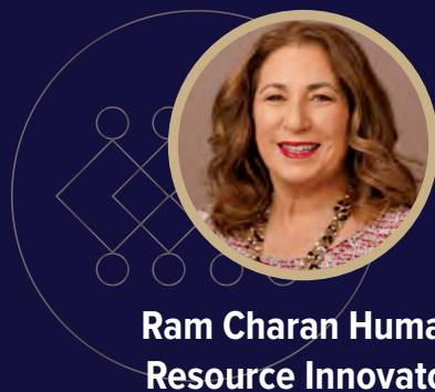
Ram Charan Human Resource Innovator

Michael Milken Chairman, Milken Institute