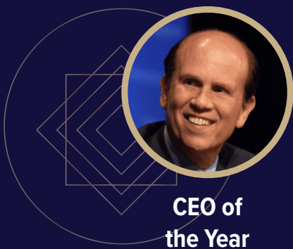
CEO of the Year

Tharseō is derived from the Greek word meaning courageous, confident and bold. The event continues to be a high-level brand illuminator, where 300 SHRM Foundation constituents gather and experience the impact of their support, advocacy and networks collectively. 2023 honorees represented the highest levels of business and policymaking, creating a strong platform from which to fundraise and build our brand. They included: